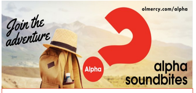
How does God guide us?

All of us have to make decisions about what we do with our lives-our work, our family, our children, the use of our time, and certainly day-today decisions. Discerning God's will can be tricky business. But the wonderful news of the Christian faith is that we're not on our own in this life. God is with us and is very engaged in our lives. If you're interested in learning more about how God guides us, consider trying Alpha.