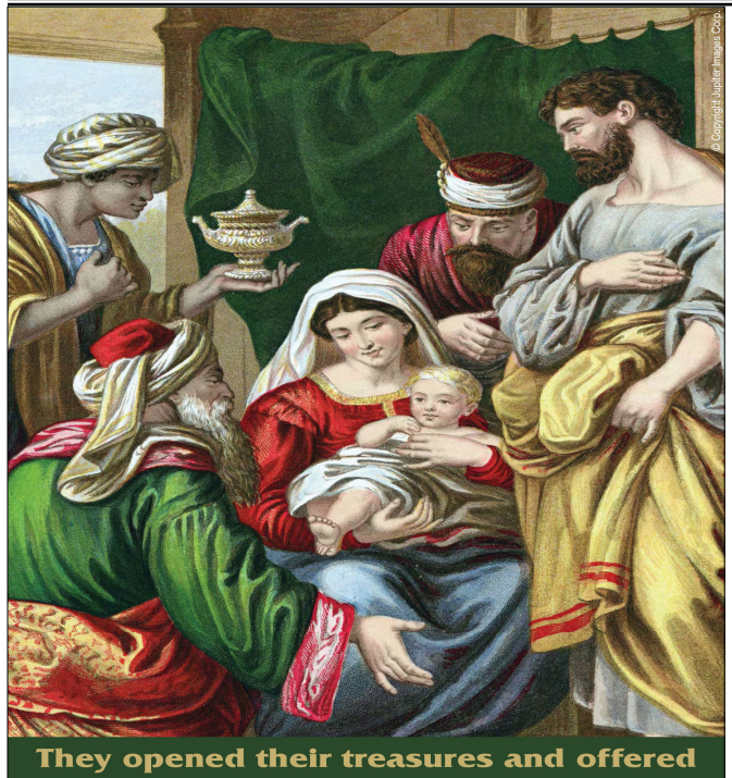
him gifts of gold, frankincense, and myrrh. – Matthew 2:11b